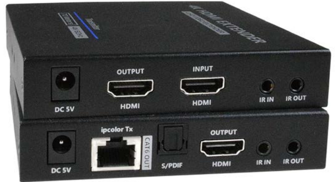
ST-C64K18GB-230C (Local & Remote Unit)