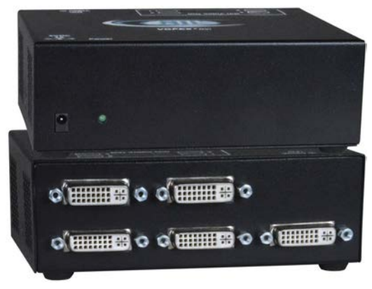
VOPEX-DVIS-4 (Front and Back)

The VOPEX® DVI Video Splitter enables up to four single link digital DVI displays to be driven by a single digital DVI source with no loss of signal.