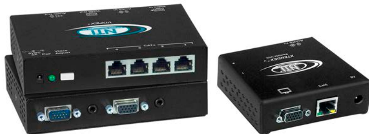
VOPEX-C5VA-4C Local Unit (Front & Back) and ST-C5VA-600 Remote Unit