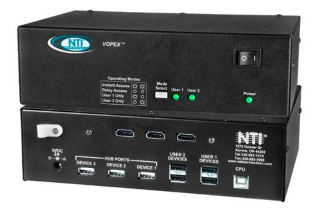
VOPEX-USBH-2 (Front & Back)

The VOPEX® HDMI/DVI USB KVM splitter with built-in USB hub allows up to four users (four USB keyboards, USB mice and DVI/HDMI monitors) to access one USB computer and up to three USB devices (printers, scanners, security cameras, etc.).