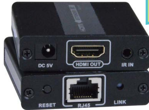
ST-C6HD-394-LC (Remote & Local Unit)

Low-Cost HDMI Extender transmits digital video and audio signals up to 328 feet (100 meters) using one CAT5e cable or 394 feet (120 meters) using one CAT6 cable. Each video extender consists of a local unit that connects to an HDMI source and a remote unit that connects to an HDMI display.