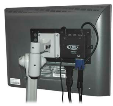
Remote unit mounted to the back of a flat panel monitor using ST-C5MK-VESA mounting kit