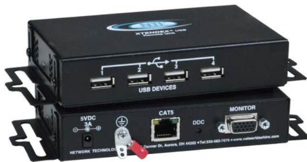
ST-C5USBVT (Remote Unit, Front and Back)

The XTENDEX® Transparent VGA USB Extender extends four USB devices and a VGA monitor up to 200 feet. Each USB extender consists of a local unit that connects to a computer and also supplies video to a local monitor, and a remote unit that connects to four USB devices and a monitor.