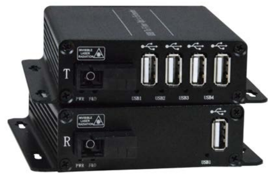
USB2-FOSC-4 (Remote and Local Unit)

The XTENDEX® 4-Port USB 2.0 Extender via Fiber Optic Cable extends four USB devices up to 820 feet (250 meters) using a single SC singlemode or multimode fiber optic cable. Each extender consists of a local unit that connects to a computer, and a remote unit that connects to four USB devices. The local and remote units are interconnected via a single-strand SC singlemode or multimode fiber optic cable.