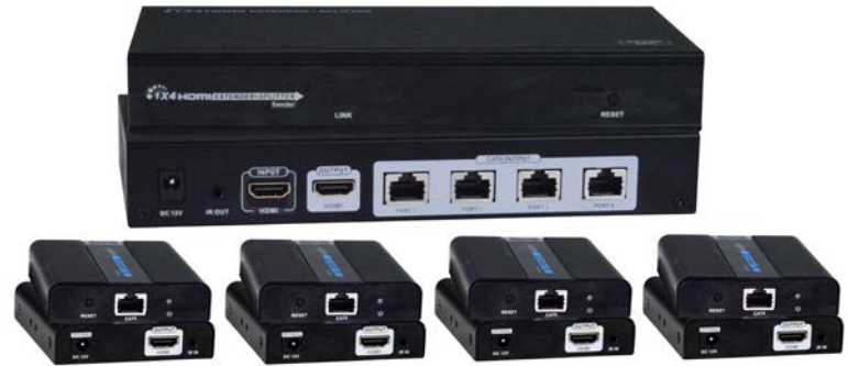
VOPEX-C64K18GB-4 Local Unit (Front & Back) and Four Included Remote Units (Front & Back)