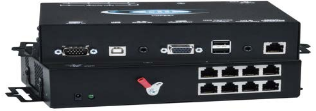
VOPEX-C5USBVA-8 Local Unit (Front & Back)

The VOPEX® VGA USB KVM Splitter/Extender allows up to eight remote users (8 USB keyboards, mice, and VGA monitors) to access one USB computer (PC, SUN, MAC) located up to 1,000 feet away using CAT5/5e/6 cable. Audio can be broadcasted to self-powered stereo speakers at the local unit and each remote location.