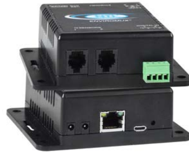
E-1W (Front & Back)