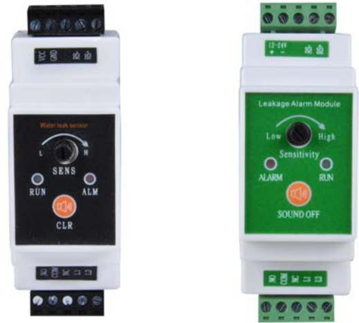
E-LDA-LC2 (Will Ship in Black or Green)

The ENVIROMUX® Single-Zone Liquid Detection System monitors up to 1,640 feet (500 meters) of liquid/chemical detection sensor cable or an under carpet leak detection sensor. When the sensor detects a water or chemical leak, the system will notify you via a visual indicator (red LED) and an audible alarm.