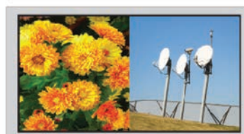
Dual Screen with Custom Mode