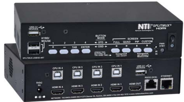
SPLITMUX-USBHD-4RT (Front & Back)