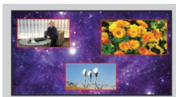
Custom Mode with Individually Configured Windows and Enabled Borders