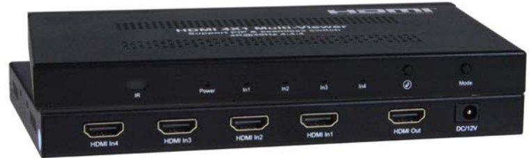
SPLITMUX-4K6GB-4LC (Front & Back)