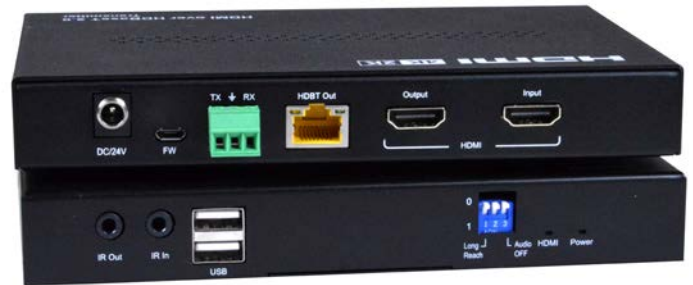
ST-C6USB4K18GB-HDBT (Local and Remote Units)