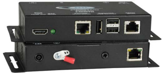
XTENDEX® ST-C6USBHE-HDBT (Remote and Local Unit)