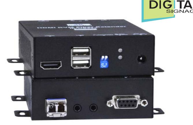
ST-FOUSB4K18GB-LC (Remote and Local Units)