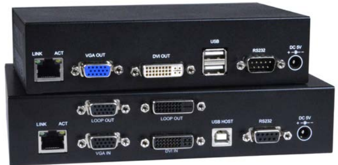
XTENDEX® ST-IPUSBVD-VW (Remote and Local Unit)