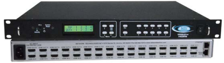
VEEMUX® SM-16X16-HD4K (Front & Back)