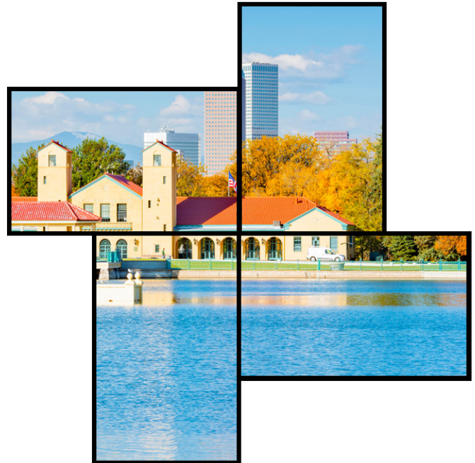
Custom Video Wall Design