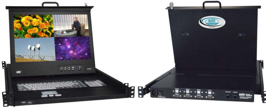
RACKMUX-D17HR-N-SUSBHD4 (Front & Back)

Display video from four HDMI/DVI computers simultaneously on a 1RU DVI LCD KVM drawer. Switch to and control any of the four computers while monitoring the other three connections in real time.